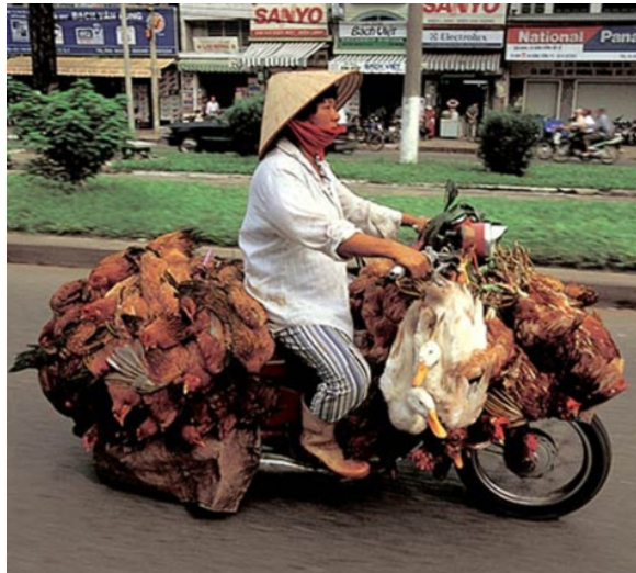
Bird-ped. I wonder if this moped runs on chicken blood....

You may be asking yourself why, why a moped? To you I say why not! Here are some great reasons you should go out right now and snap one up yourself.